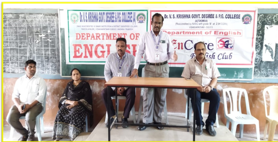
PRINCIPAL ADDRESSING STAFF AND STUDENTS