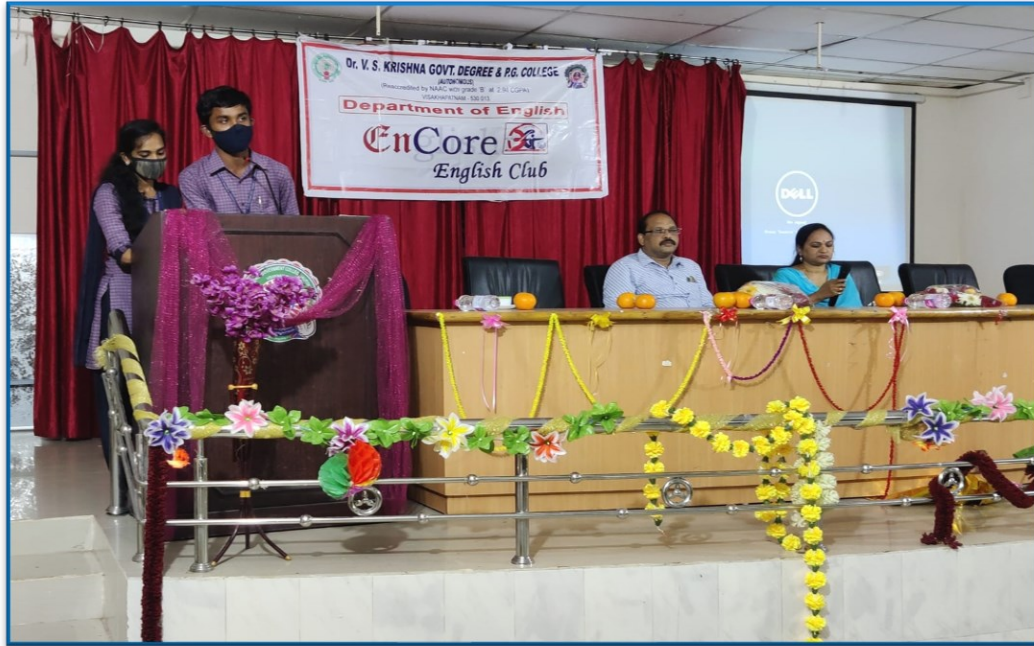
STUDENTS ANCHORING THE PROGRAMME