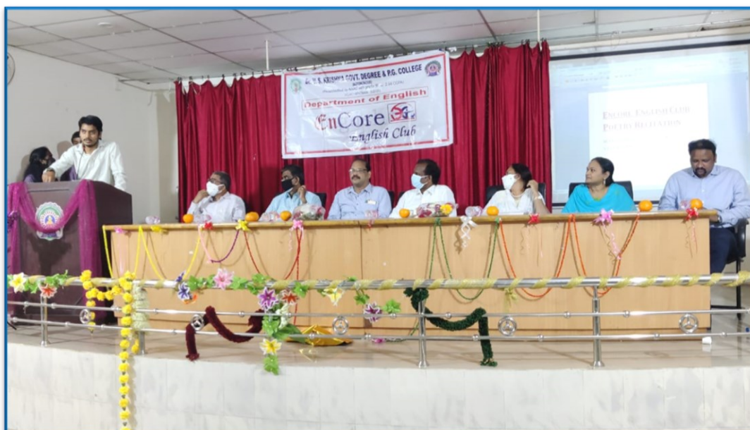
STUDENTS RECITING AND EXPLAINING THE THEME OF THE POEM