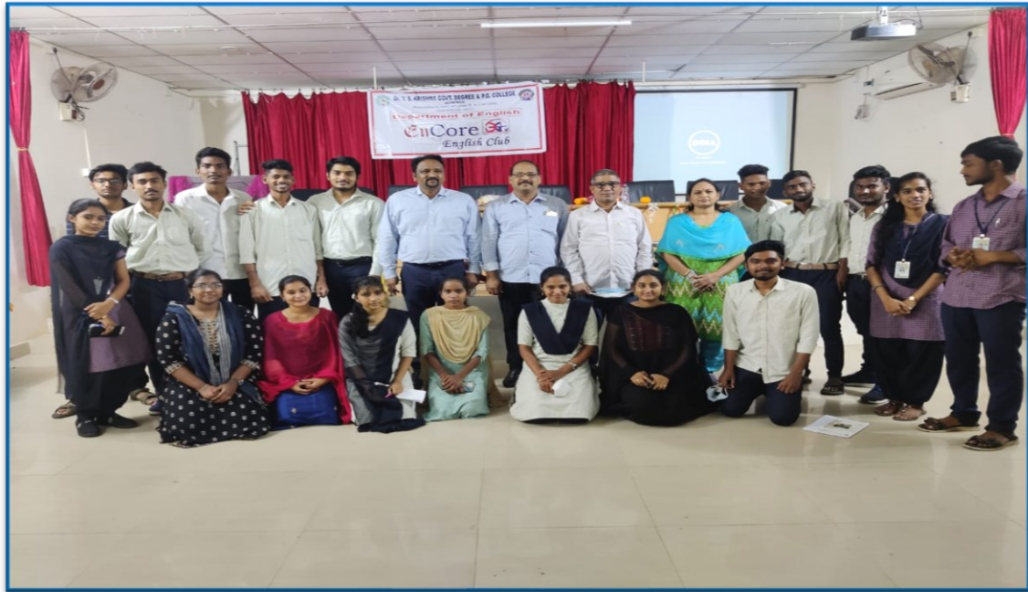
ENGLISH FACULTY AND THE PARTICIPANTS