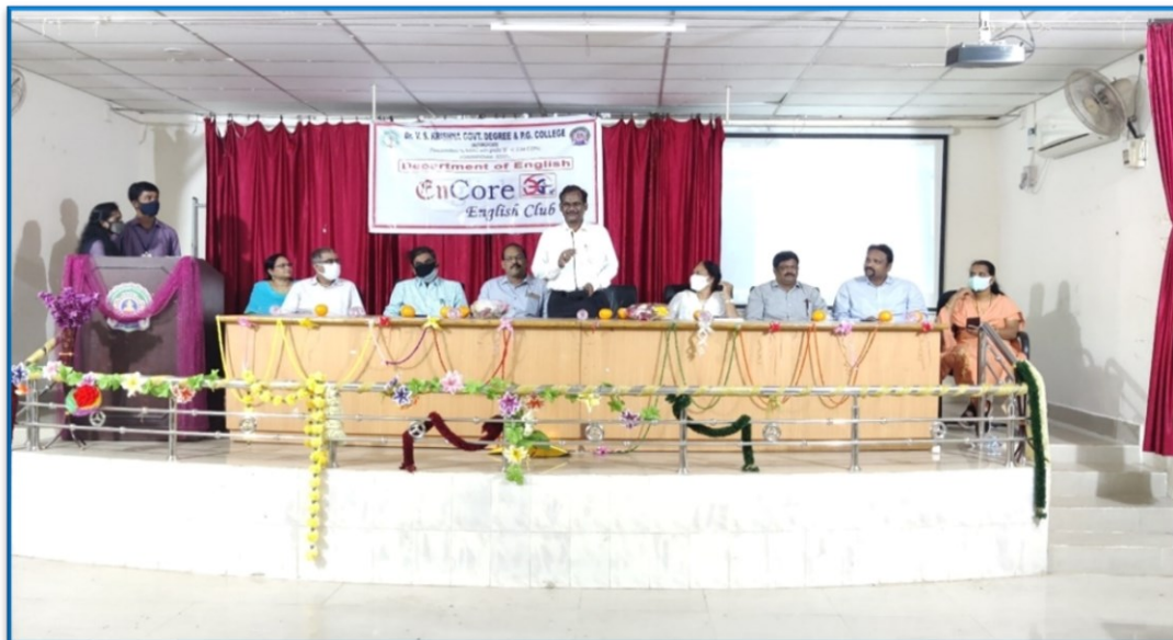
PRINCIPAL ADDRESSING THE STAFF & STUDENTS